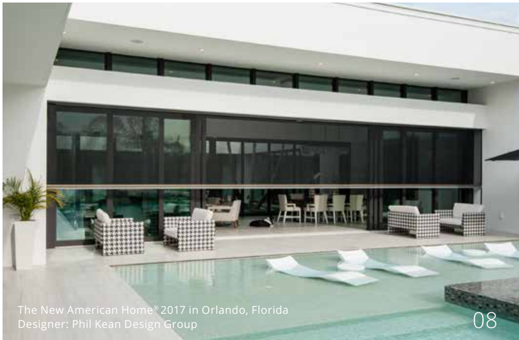
The New American Home® 2017 in Orlando, Florida Designer: Phil Kean Design Group

Phantom's motorized screens can now cover openings up to 40 feet wide! This is well over the industry standard of 25 feet and displays beautifully across your home. This screen truly transforms your living space to create an oasis that will WOW your guests.