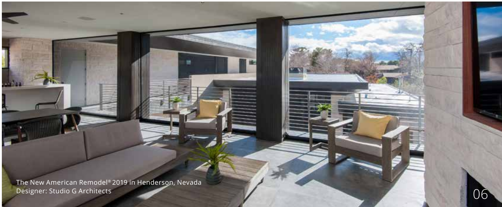
The New American Remodel® 2019 in Henderson, Nevada Designer: Studio G Architects