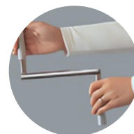
Crank Pole (Manual)