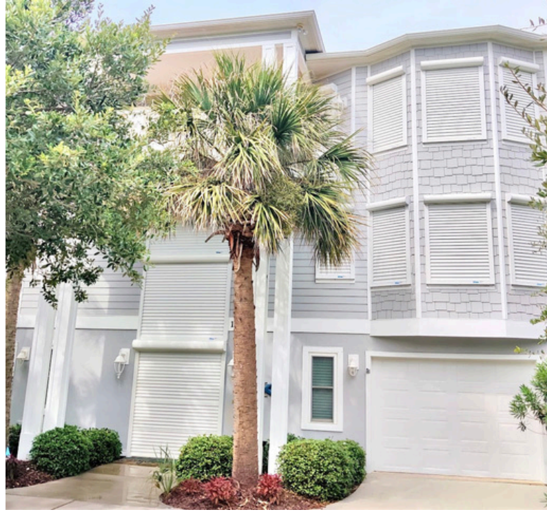
Qompack shutters offer reliable protection with elevated style.

By investing in Qompack hurricane shutters, you can safeguard your home from the ravages of storms and enjoy peace of mind knowing that your property is well-protected.