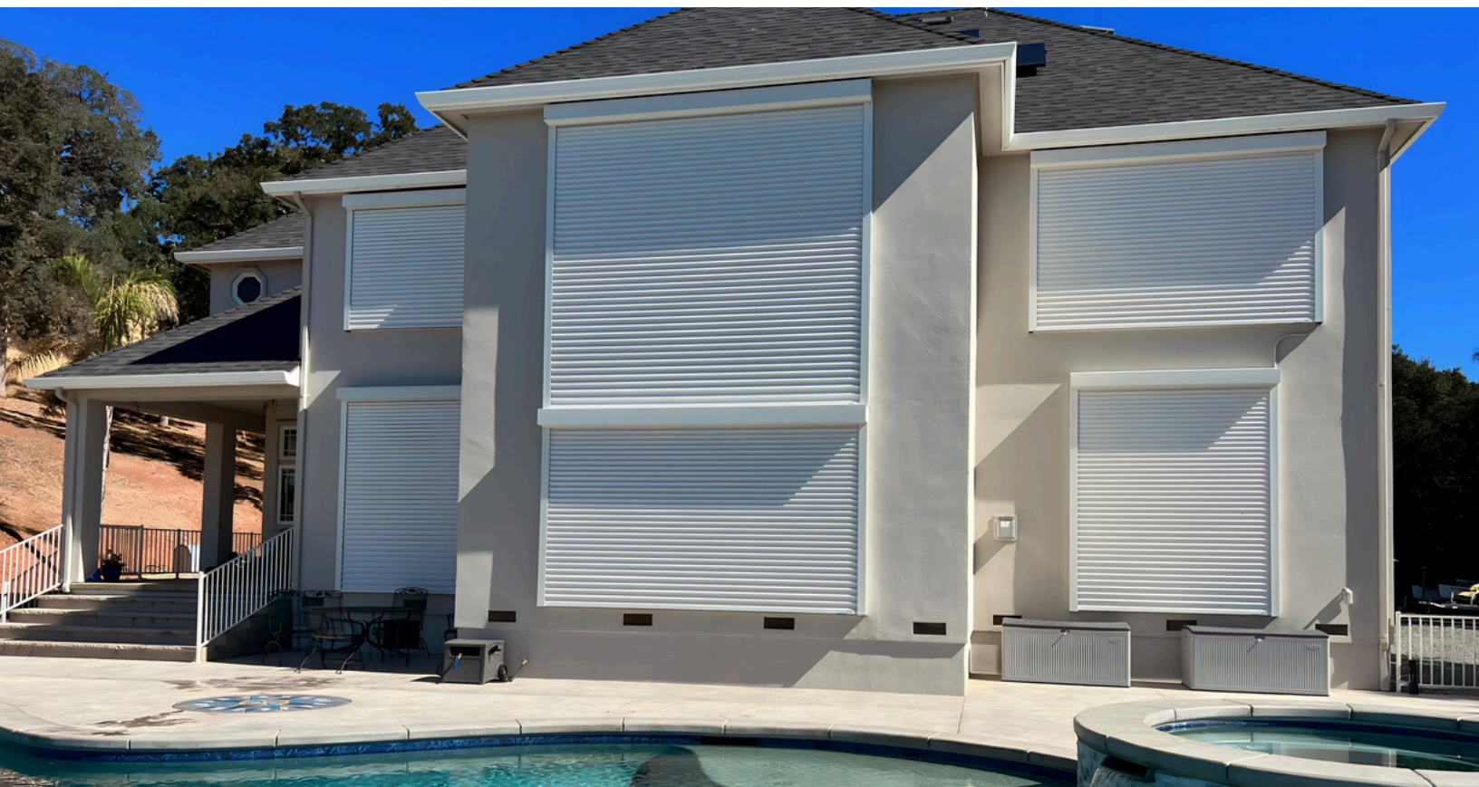
Qcompact shutters broad spans have you covered, with a wide range of configurations protecting every vulnerable opening of your home.