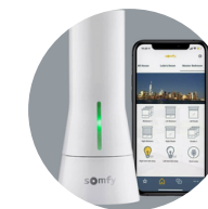
TaHoma™ (HZ) (Motor)

QMi partners with industry-leading motor manufacturers like Somfy® and OZ Roll® to offer the highest quality drive, software, and control systems.