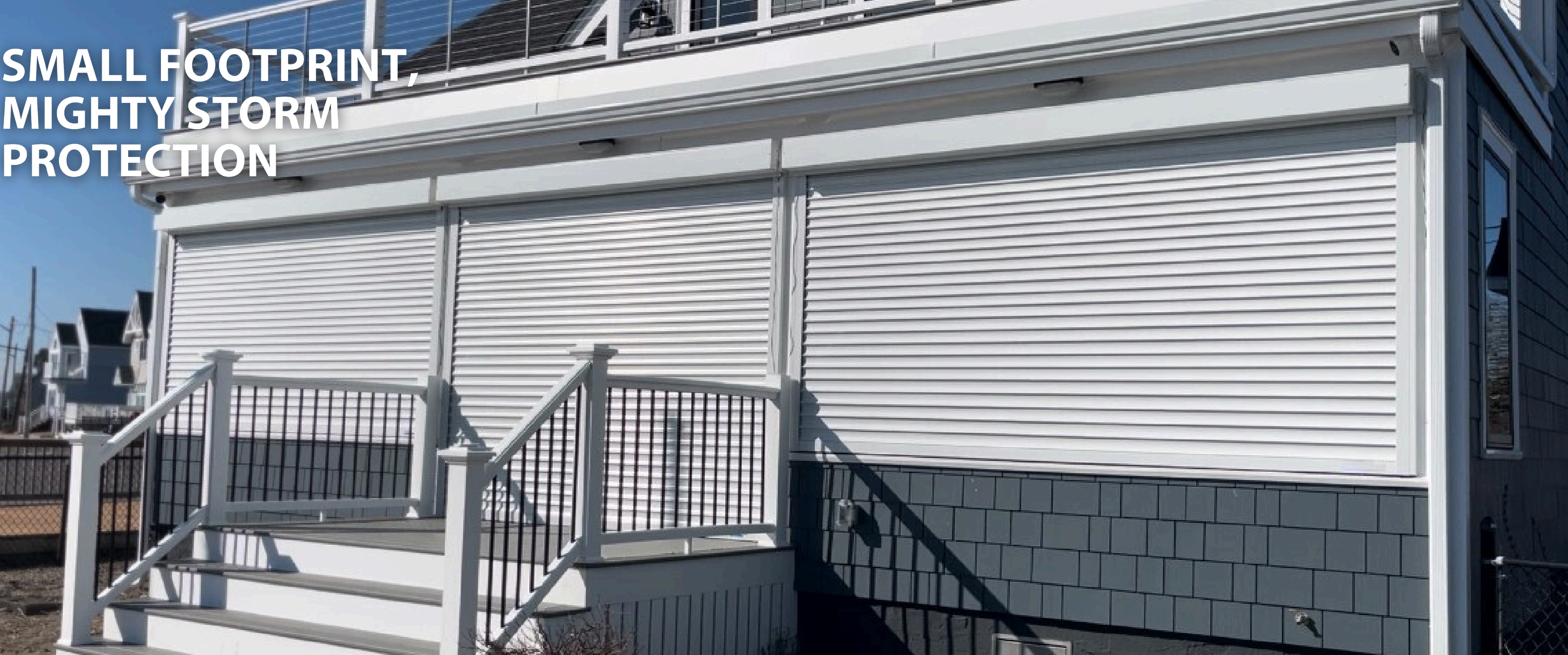
Hurricane protection at beach home on the Jersey shore.

Shield your home against extreme weather with our Qcompact Hurricane Shutters, long hailed as the pinnacle of storm protection. These shutters provide unrivaled strength and are engineered to meet the most stringent wind load requirements.