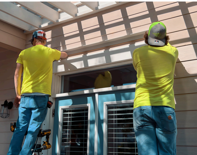
Expert QMi dealer partners preparing another exterior Qompack shutter over the home's double door.

Safe and secure with their new shutters from QMi, these gulf coast residents are ready to face any future weather event that comes their way.