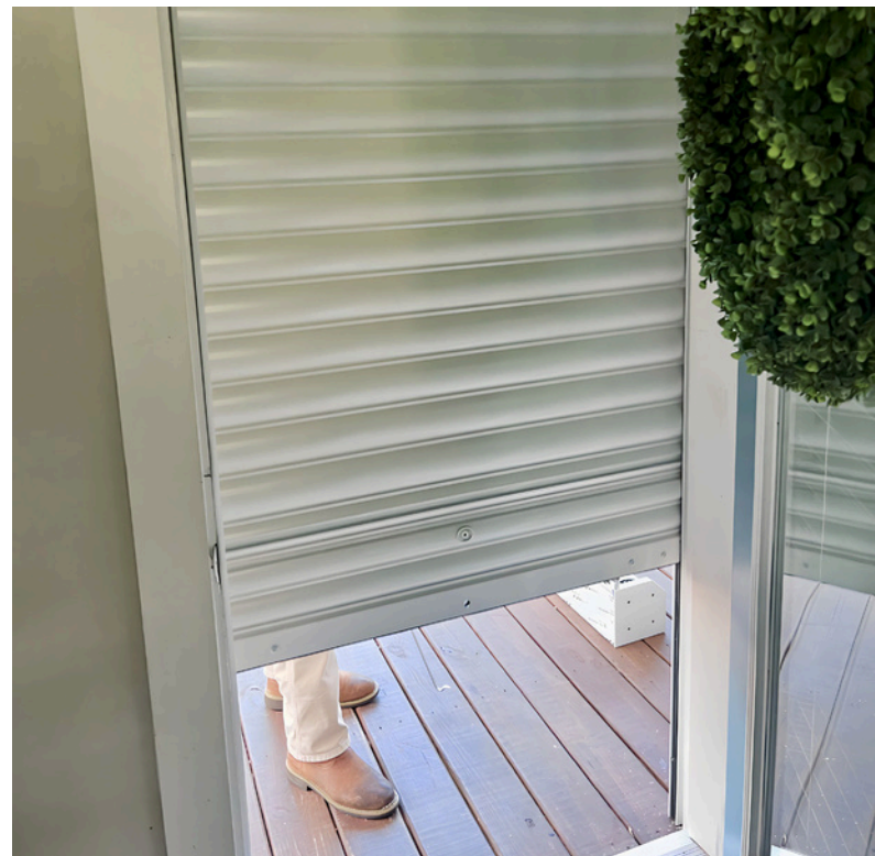
An exterior mounted Qompack shutter being manually closed after being installed to protect the home's front door.