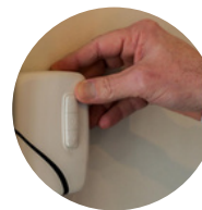
Battery (EZ) (Motor)