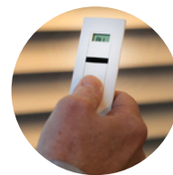
Wireless Remote (HZ) (Motor)