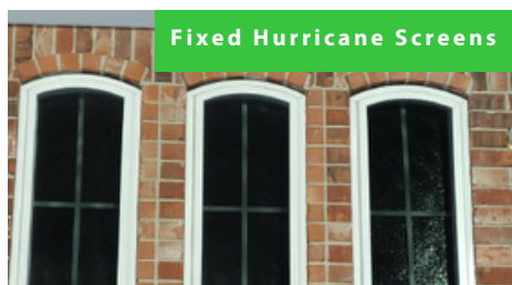
Fixed Hurricane Screens