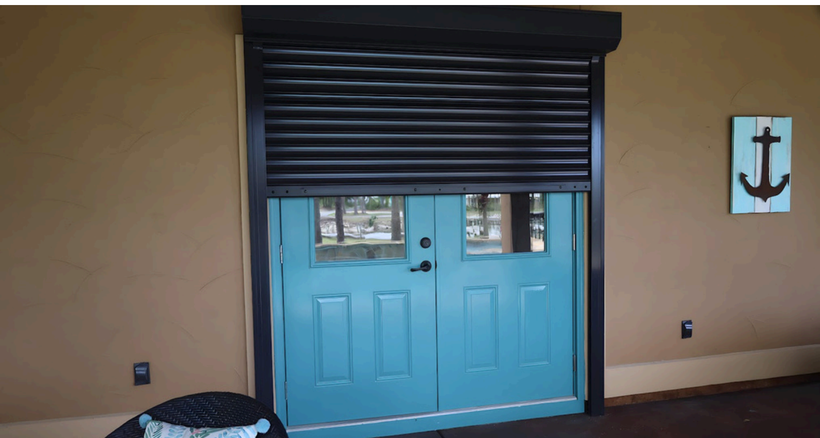
Qomact shutter securing a double-door opening from extreme weather.