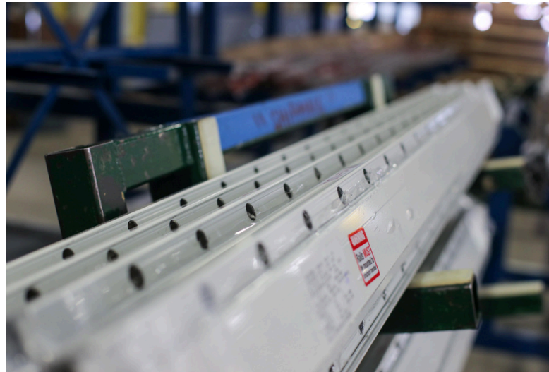
Pre-drilled rail holes make for an even easier installation.