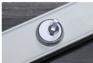
Base Slat Thumbturn