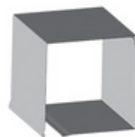
90° angle (square)

Constructed from aluminum alloy in 6, 6.5, 7, 8 and 10 in. sizes.