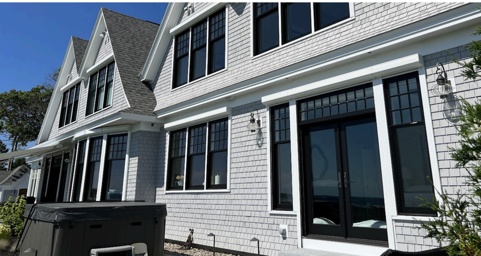
White Qcompact shutters protecting the windows and doors of a ocean front property in Maine.