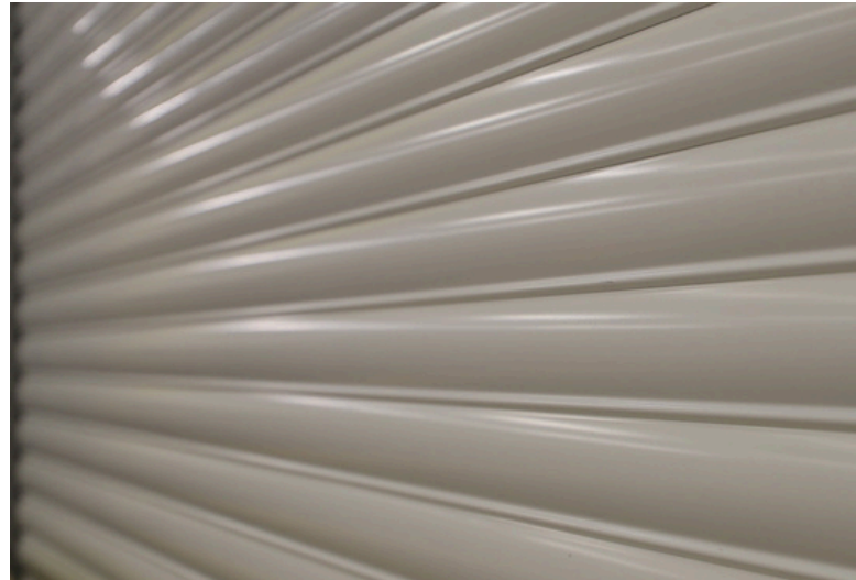
Qompack's unmatched strength meets the highest wind loads at span.