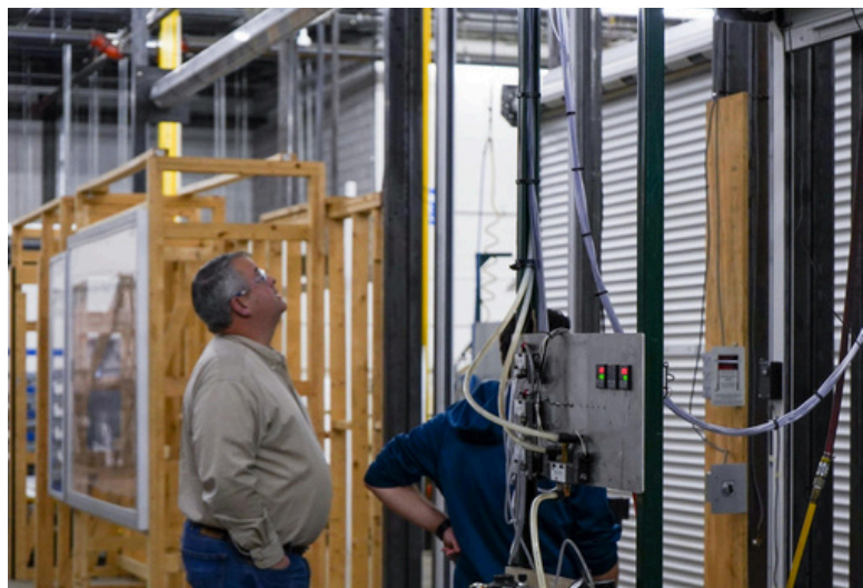
QMi tests for hurricane performance and overall cycle durability.

Confidently Secure Your Home From The Strongest Hurricanes.