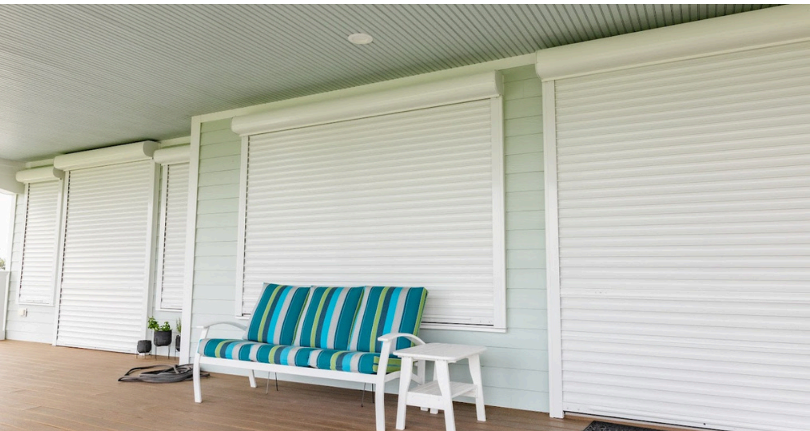
Qompack shutters protecting openings on a covered porch.