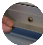
Spring Assist (Manual)

Remote operation provides flexibility across your home.