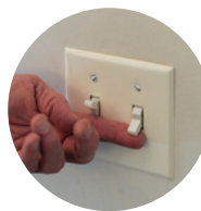
Wall Switch (Motor)