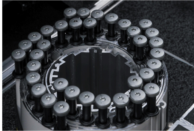
The elegantly designed and tightly nested Qcompact roll sets the standard for sleek security and strong style.