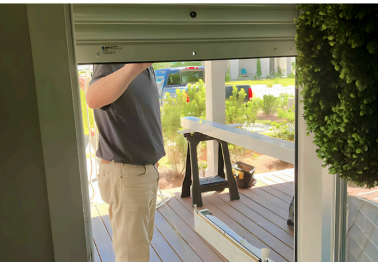
The instinctive finger pull paired with a mid-curtain lock makes operating and locking manual Qomact shutters absolutely effortless.