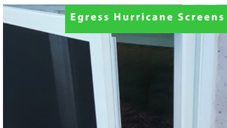
Egress Hurricane Screens