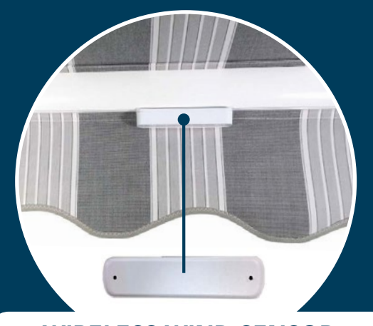
WIRELESS WIND SENSOR