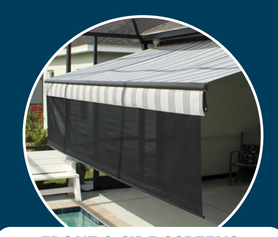
FRONT & SIDE SCREENS