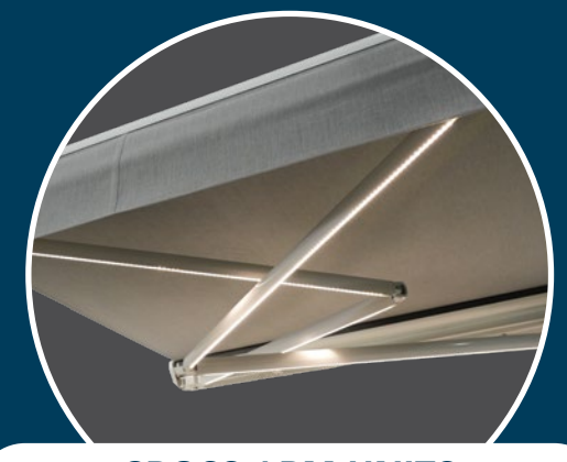
CROSS ARM UNITS FOR NARROW, DEEP APPLICATIONS